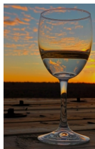
Sunset Happy Hour Accepted Sue Shaw