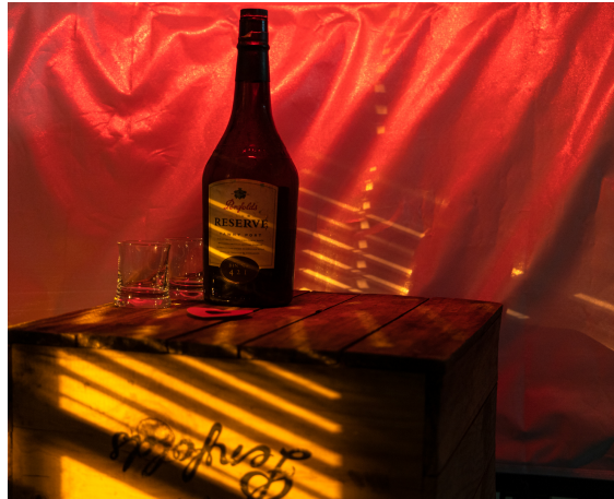
For that special occasion