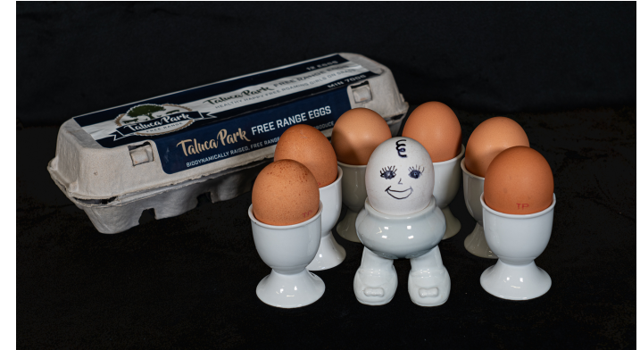
Talutha Park Eggs