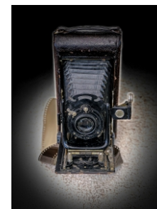
Ensign Accepted Dawne Harridge