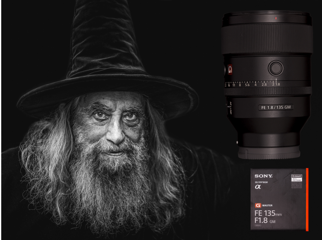
G Master 135