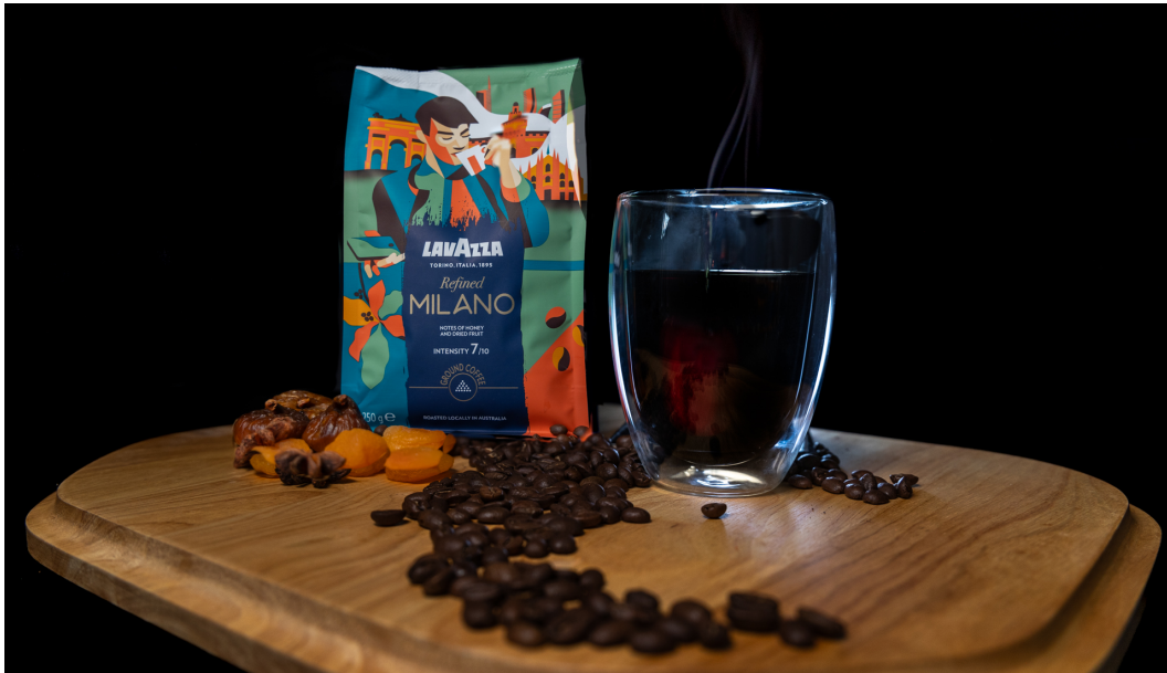
Lavazza coffee hot with dried fruit