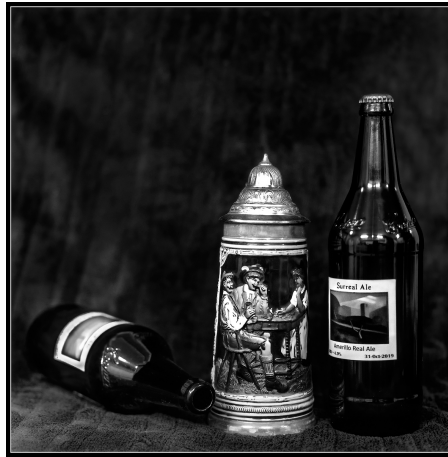
Beer 101 Credit Effan Effans