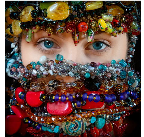
Bedazzle Jewellery