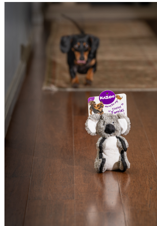
Kazoo Credit Les Schumer AAPS QPSA GPU Cr1