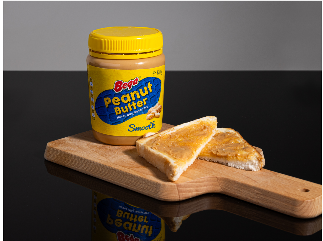
Bega Peanut Butter