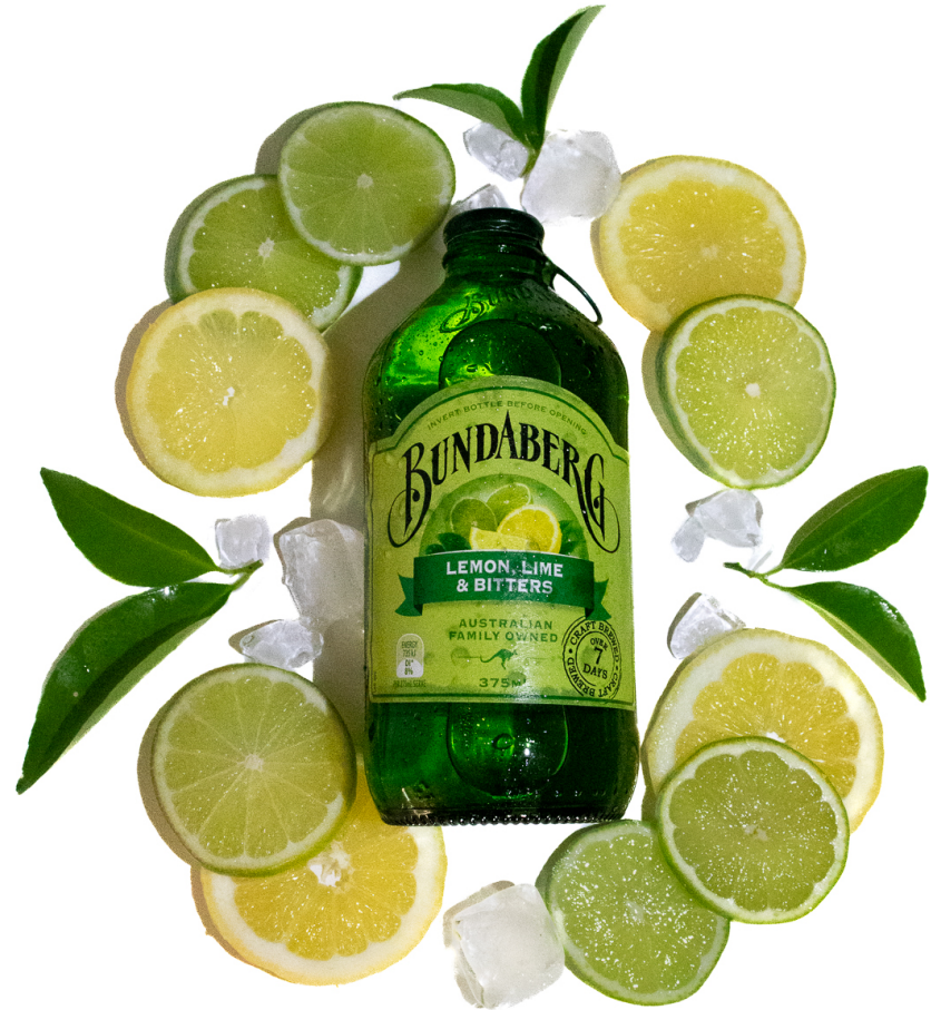
Lemon, lime and bitters