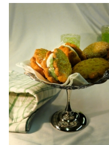
Sweet Treats Accepted Jill Bartlett