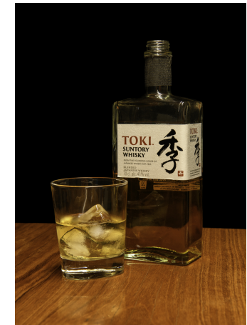
Toki Suntory Whisky