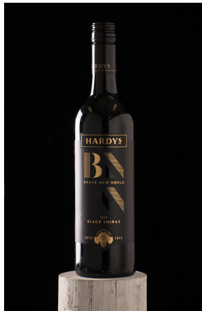
Black Shiraz