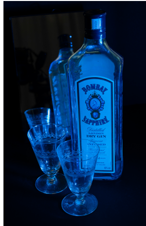
Bombay Sapphire shoot