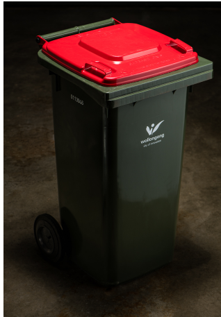
Remondis Red Regular